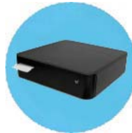
Optional Purchase: Cashbox / Receipt Printer