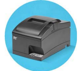
Optional Purchase: Kitchen Order Printer

Groovv Flex Point-Of-Sale system includes the following full-featured components: