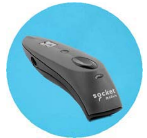
Optional Purchase: Barcode Scanner